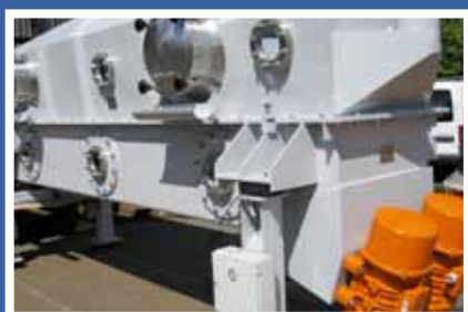
Twin vibrator motors on the rear of the machine.

The process involves inducing solid feed material into a curtain of air which creates a turbulence as it passes through the mass of solids creating a heat transfer rate between air & solids. This gives up to 50 times a greater heat transfer than that of a static layer and is equally suited to both small dense powders and large friable agglomerates.