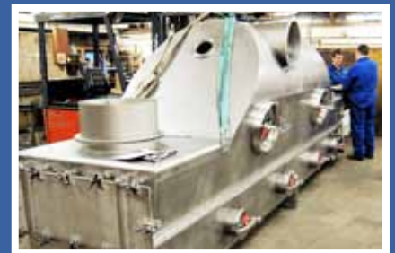
A sanitary fluid bed manufactured in 316 stainless steel for the production of protein powders under construction. The clean lines of this machine make it ideal for use in the food and dairy industry.