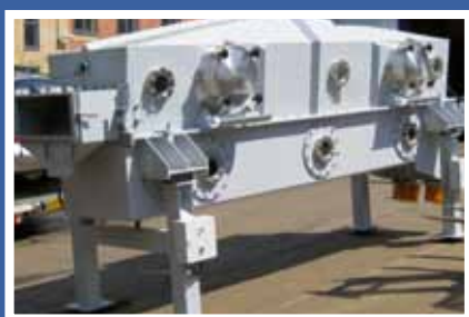
A Continuous fluid bed for the Chemical Industry mounted on pneumatic inflated vibration isolators.

Specialist product designs can be supplied including closed inert circuit fluid bed systems for solvent and flammable material drying.