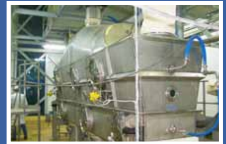
Typical Dairy Fluid bed all stainless steel construction with automated weir plates and water removal ducts on the underside for CIP recycle.